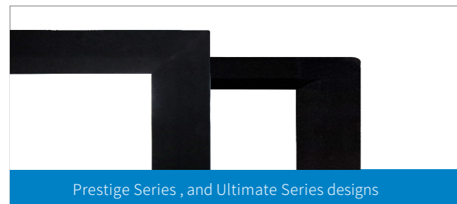
Prestige Series, and Ultimate Series designs