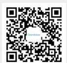
Grandview QR code Grandview wechat QR code