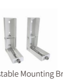
Adjustable Mounting Bracket