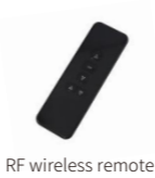
RF wireless remote